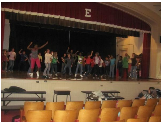
Zumba at our Erwin Elementary Site

Where our aim is "Reaching for Success one star at a Time"