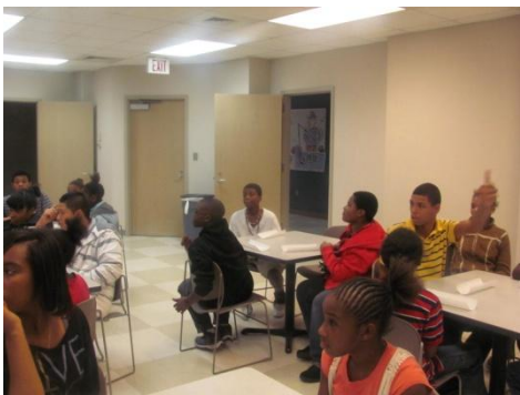
Youth Leadership Middle School Group

The purpose of the Youth Leadership Council is to empower youth and young professionals by promoting leadership development, civic engagement, and understanding while building awareness of issues facing youth and the Harnett County community.