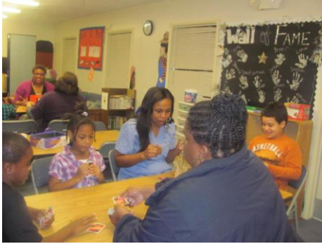
Parents and Students Enjoying UNO

On Saturday, December 2, 2011, our program hosted our Family Game Night until 7:30. The event consisted of UNO, Xbox, Karaoke, Scattergories, Taboo, Air Hockey, Pool, food, and much more. The students and parents had a great time and at the end of the night was asking when was the next Family Game Night. It was a huge success!