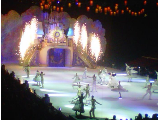
After school students went to Disney on Ice for a field Trip on Friday, December 9, 2011